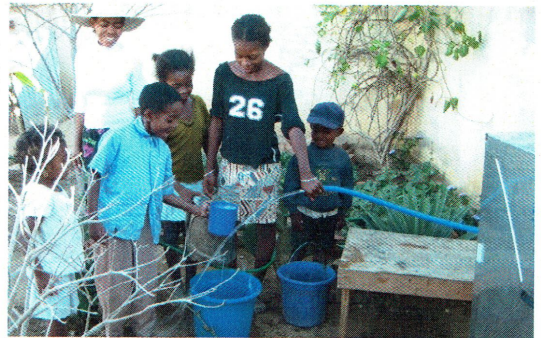
First test with the installed water treatment plant from Trunz Water Systems.

Number of signs incl. space: 2'368 signs