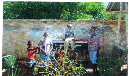
Until October 2009 the kids knew refreshing, drinking water only from bottled water which they couldn't afford.