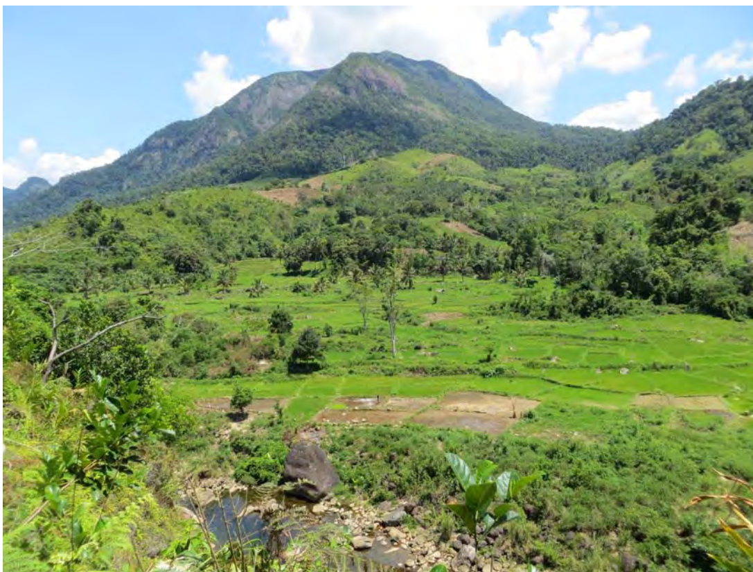
A look from outside the park into the interior of Marojejy.