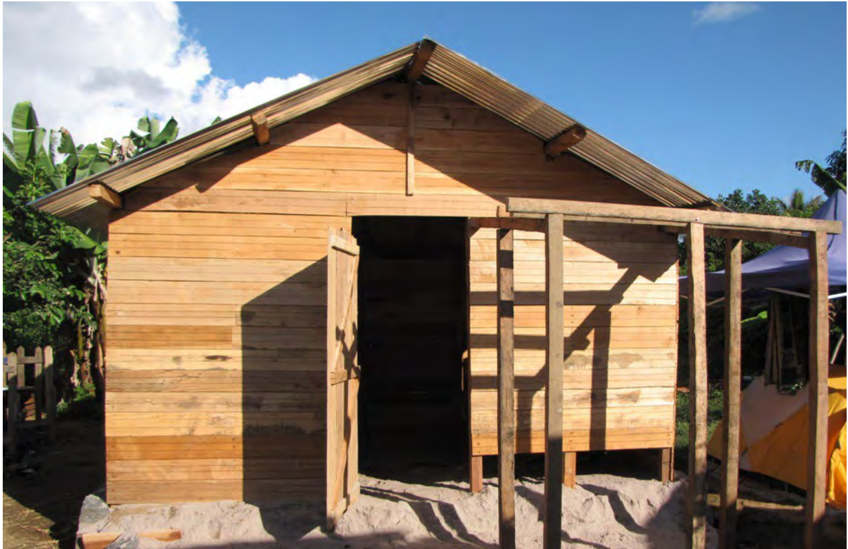
New cookhouse at Antanetiampo Nature Reserve.