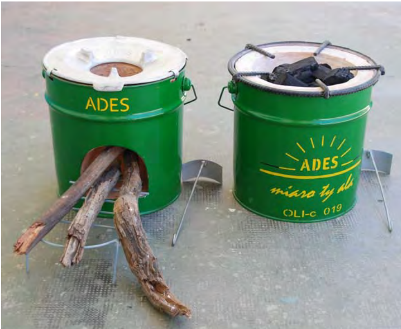
ADES rocket stoves for wood or charcoal.

found three types of locally made charcoal stoves for sale on the streets of Sambava. "Fatana Mitsitsy" (translation: frugal cook stove) are the most fuel-efficient of the three but are not durable (only lasting up to 5 months) and are difficult to make as they require clay, metal, and cement. At 7,000 AR each ($3.30 USD) they are moderately priced.