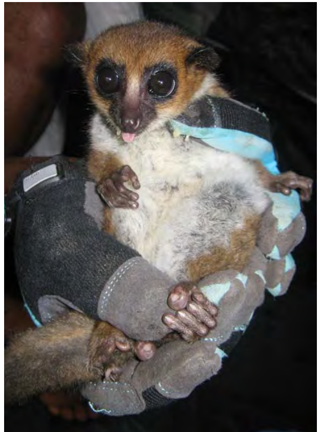
Another dwarf lemur trapped in the Camp 2 area.

"...it looks like there are at least two sympatric dwarf lemur species at Marojejy, and maybe more."