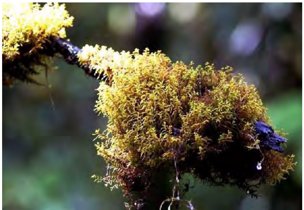
Bryophytes include mosses, liverworts and hornworts.