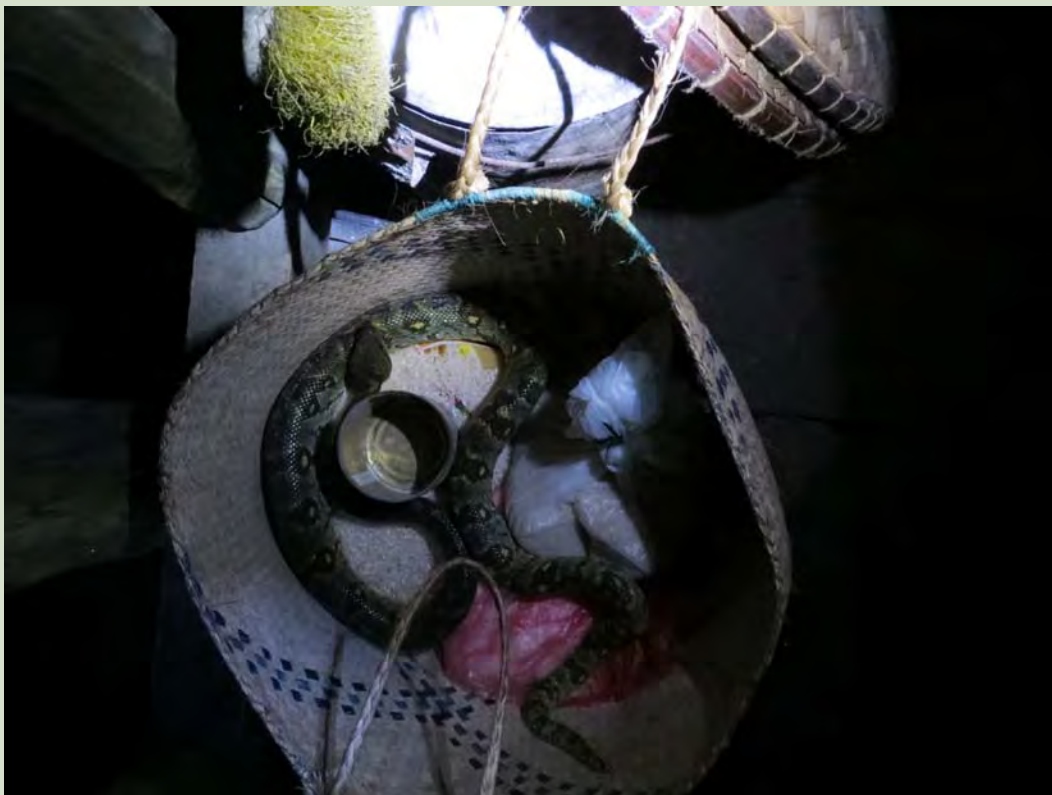
Guardian of the rice against rats at Camp 2 : a Madagascar tree boa, Sanzinia madagascariensis .