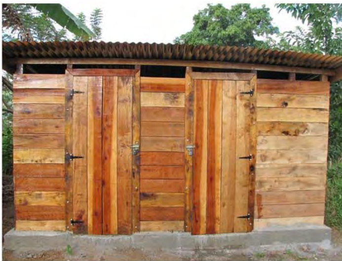
New shower and toilet facilities.

Additionally, just this year more than 11,000 seedlings in twenty different (primarily native) species have been grown in Antanetiambo's tree nursery. These include endemic hardwoods such as Ebony and Hintsia, fast-growing endemics such as Albizia sp., Cryptocarya sp., and native bamboo. For the non-natives, super-fast growing Acacia, fruit trees such as lychee, banana, and jackfruit are ready to be planted out. As rainy season (January to April) has just arrived, we have started planting about 1000 trees per week inside some of the newly purchased degraded parcels of Antanetiambo Nature Reserve.