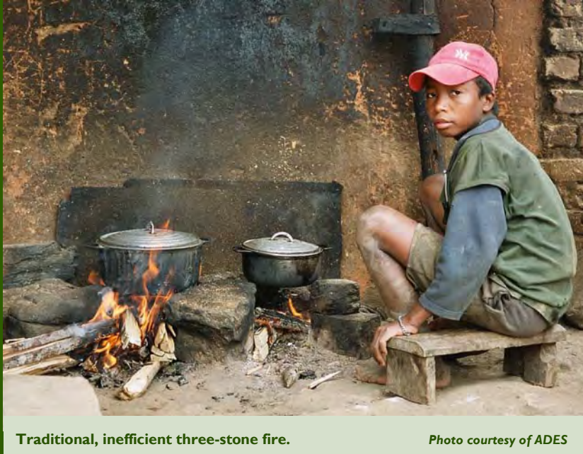
Traditional, inefficient three-stone fire.

Over two billion of the world's population burns biomass to cook each day, predominantly using inefficient open fires and traditional stoves. In addition to wasting energy due to