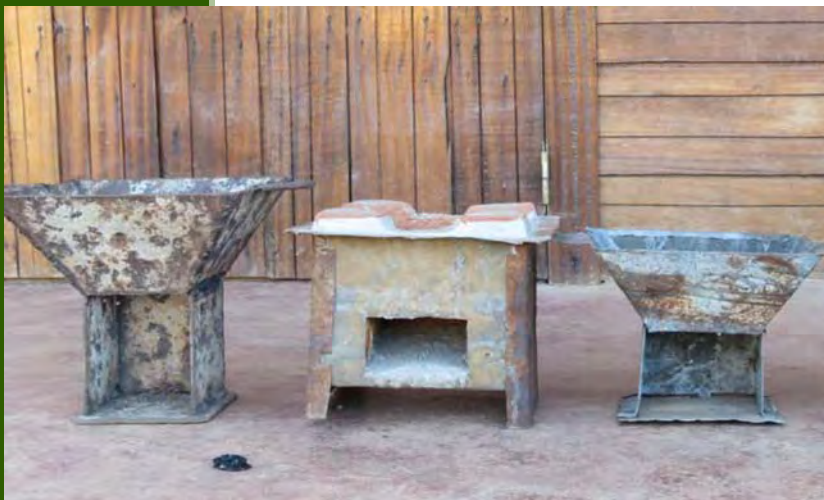
Locally made stoves in Sambava.

In Madagascar, approximately 80% of the population cooks with charcoal or firewood and 92% of the nation's energy comes from burning these natural resources which are