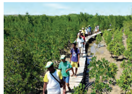
Not on the wood path! – ADES employees wandering through the mangrove plantations and receiving expert instruction.

Mangrove trees are enormously important for the population of coastal areas. Provided they are healthy, they