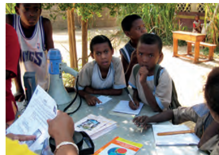
Attentive students can easily be distracted by a camera.

Many school classes and university students visit our centres as an addition to their normal education programmes. This way ADES is able to make them more aware of environmental issues. In 2017, 6.672 children, 405 parents and 902 teaching staff participated in our programme. Unfortunately, the plague outbreak caused schools to be closed so that less children than planned were able to visit our centres.