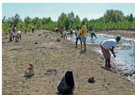
In a few years, these still fragile saplings will help to protect the coastline from erosion and storm damage.

butors to this trend...and an end is not in sight. The good news is that the level of awareness that mangrove trees need to be protected in the same way as rain and dry forests is increasing. With this in mind, every member of the Tuléar team was charged with planting 150 mangrove saplings. Our goal of 5.000 new plants was thus achieved. Since 2008, the local NGO, Ala Honko has, together with many partners, planted 1.6 million new trees and has thereby positively contributed to the environment in the region.