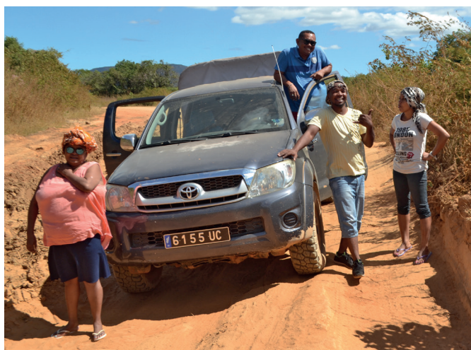
The ADES Mahajanga team on its way to the north-east

At the eastern northern tip of Madagascar lies the Sava region with a population of around 1.3 million. The name „SAVA“ is derived from the four district capitals Sambava, Andapa, Vohimarina and Antalaha. The area is the world centre for the cultivation of vanilla and cloves and is home to the Marojejy National Park and a large part of the famous Masoala National Park. The forests of Masoala National Park are home to thousands of tree species – in total about two percent of the world's known plant and animal species. However, these forests are also under great pressure due to their excessive use for the production of rice, charcoal and firewood. The forest area is declining at an alarming rate. ADES has hardly been present in Sava so far, but is well known due to its long-standing cooperation with the Lemur Conservation Foundation, which is very active there.