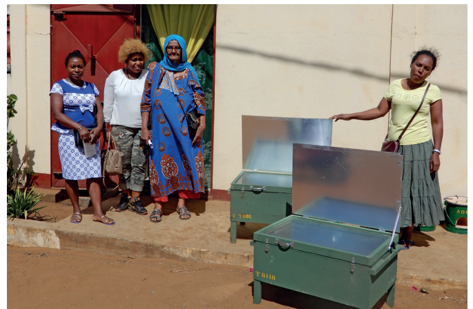
Revendeuses à Diego Suarez

Despite the health crisis and the restrictions due to the measures against the pandemic, the first sales results are satisfactory. The rising cost of charcoal in the city has motivated the population to buy energy-efficient stoves in order to reduce fuel costs as much as possible.