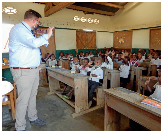
The Swiss ambassador in the school «les Salines»