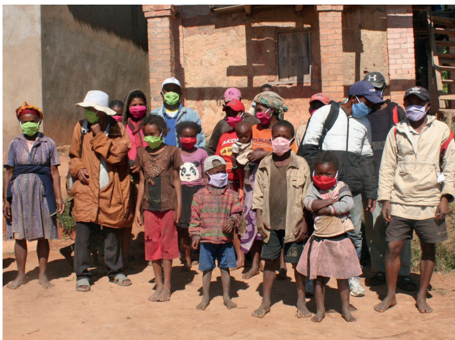
Protecting themselves with masks: the population of Sahavondronina

The pandemic will further complicate the conditions for ADES in Madagascar. Around 75 percent of Malagasy workers are employed in the informal sector. These people, who were already living in poverty before the pandemic, are suffering greatly under the current circumstances. Those who work daily by hand into the mouth, whose existence is quickly threatened in a crisis situation. Millions of people in Madagascar are threatened by hunger and misery. The already minimal purchasing power of people in the informal sector is further reduced by the pandemic. This makes it even more difficult for ADES to reach these people. Apart from the introduction of a flexible pricing model, ADES is increasingly looking for ways to give away cookers to low-income families in return for work, for example in reforestation projects.