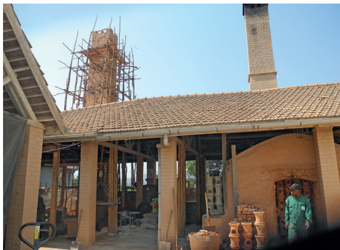
The new blast furnace nearing completion

Despite the pandemic and adverse circumstances, ADES is continuing its projects. In 2019, ADES launched the expansion project with the support of the International Energy Access Programme (EnDev). It includes a new blast furnace for firing clay cores in Fianarantsoa and the realisation of two new mobile centres. With the second blast furnace, ADES will ensure the production of cookers even if demand increases in the coming years. With the new mobile centres ADES reaches people outside the urban areas and sensitizes them to environmental problems and to advanced cooking solutions.