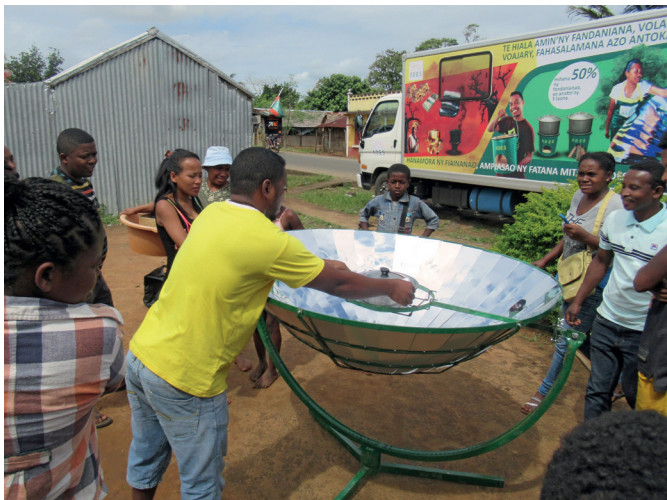
Cooker demonstration with parabolic solar cooker

scale by sea from Tamatave to Antalaha and Vohimarina and temporarily stored in fixed depots.